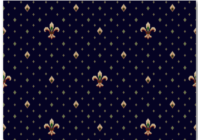
▲ Midnight 30