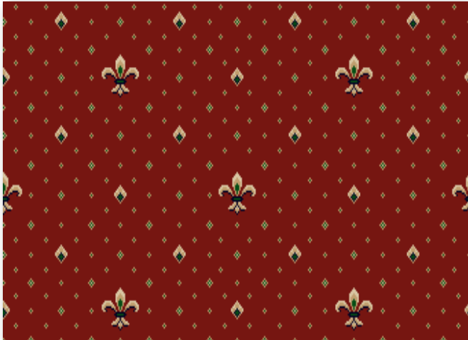
▲ Regel Red 10